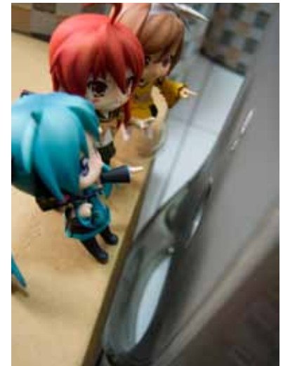
Introduce your students to ELMO Reviews today.